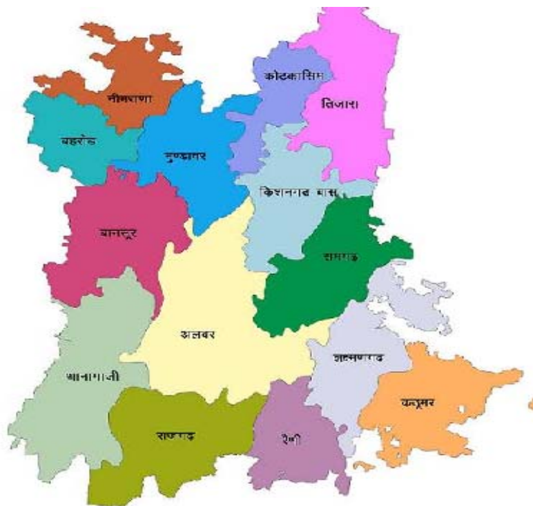
Alwar District Map

The district is situated in the north-east of Rajasthan between 27°4' and 28°4' north Latitudes and 76°7' and 77°13' east Longitude. Its greatest length from south to north is about 137 K.M. and greatest breadth from east to west about 110 K.M. It is bounded on the north and north-east by Gurgaon (of Haryana) and Bharatpur district and on the north-west by Mahendragarh district of Haryana, on the south-west by Jaipur and on the south by Sawai-Madhopur and Jaipur districts. There are 16 Tehsil head quarters in Alwar district and each one has a Tehsildar.